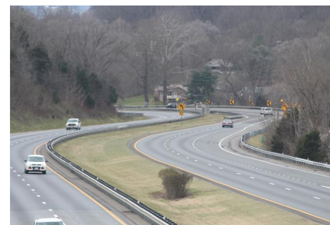
I-81 Southbound S-curve near mile marker 168